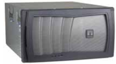
Figure 1) NetApp FAS6200 controller.